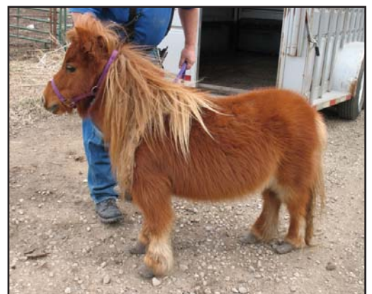
A miniature horse seized in the raid with severely overgrown hooves.