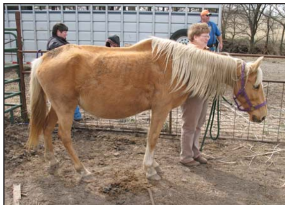
This extremely underfed and malnourished mare was full-term pregnant when rescued.