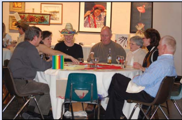
Gala attendees enjoy a competitive game of Horseopoly.

Attendees enjoyed dinner, a silent auction, live music and festivities, including a fun-filled round of Horseopoly. The event raised a total of more than $7,000 for the rescue, making it a true success.