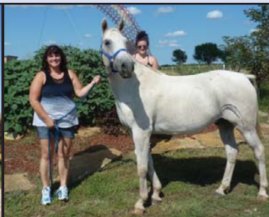
ACE with adopters