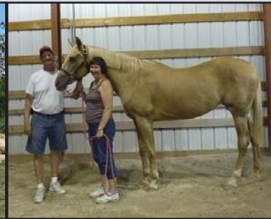
Faith with adopters