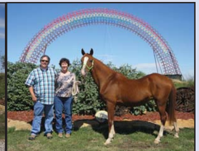
Lexi with adopters