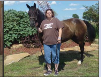
Saffron with adopter