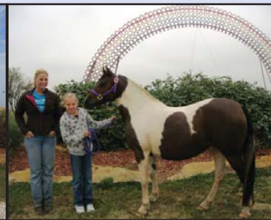
Daisy with adopter