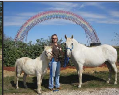
Midget and Palomita with adopters