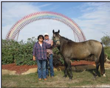
Rio with adopters