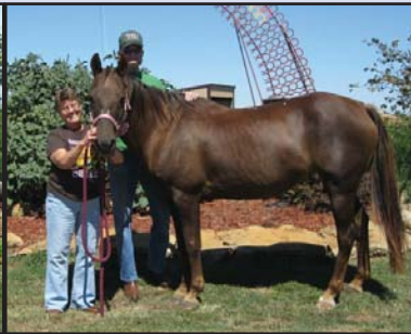
Ladybug with adopters