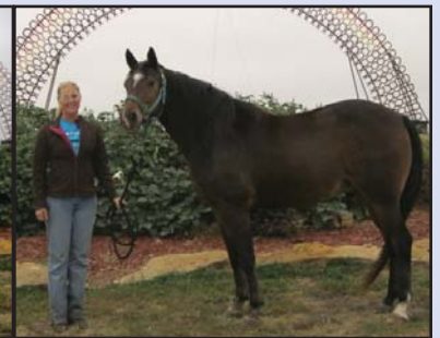
Luckyman with adopter