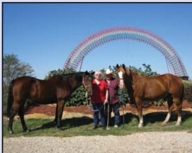
Lois and Clyde with adopters