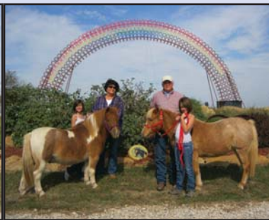
Freedom and Strawberry with adopters