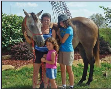
KoKo with adopters